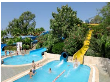
Aqua Pool 1