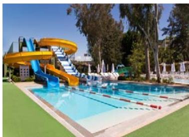
Aqua Pool 2