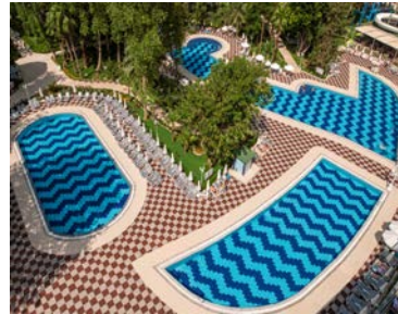
Pool3(top left), 4(middle), 5(top right)