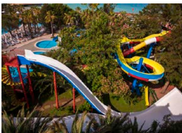
Aqua Pool 3